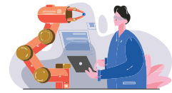
Intellectual Property of your technology