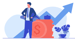
Planning & Pitching