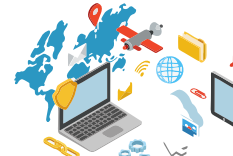
Policy & operational support for smooth on-campus technology commercialization