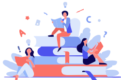
Policy & process driven incubation center on the campus