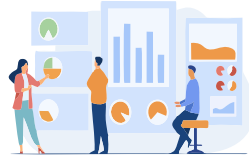
Invention Vs. Innovation