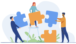
Incubation & Incubators