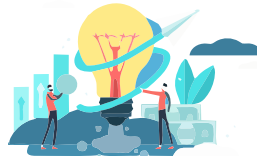
Quality to apply & fetch government grants for incubator