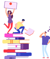
Technology Description & Development